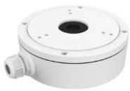
DS-1280ZJ-M Junction Box